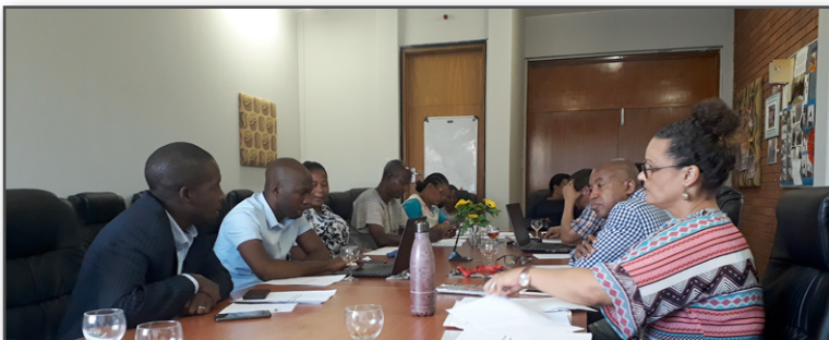
Language Centre Staff in their Boardroom.