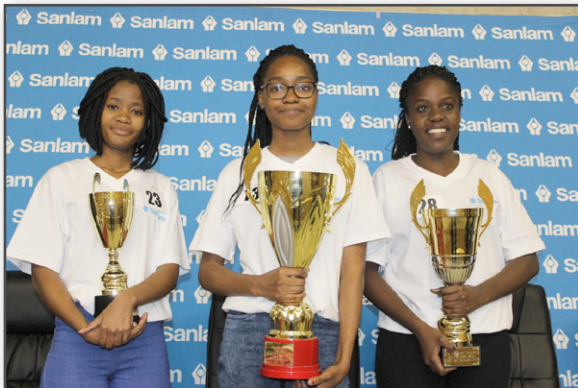
Winners of the Spelling Bee Competition 2018.