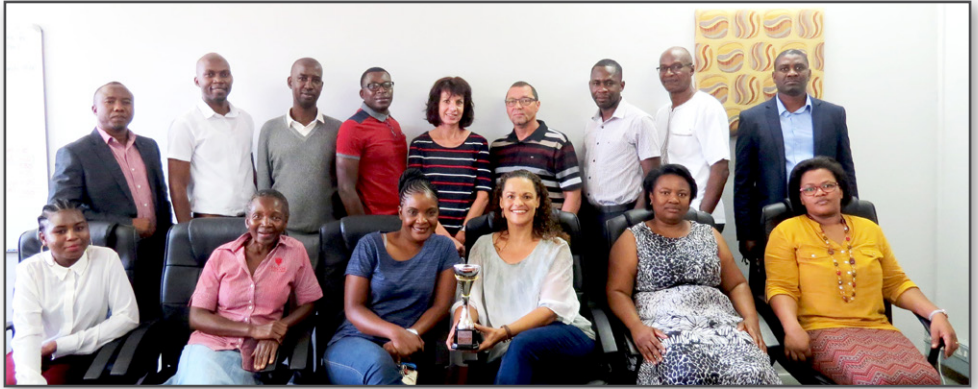
Language Centre staff with their second place trophy from the Potjiekos Competition & Traditional Game Day in 2018.

For any enquiries about the Language Centre, please contact: